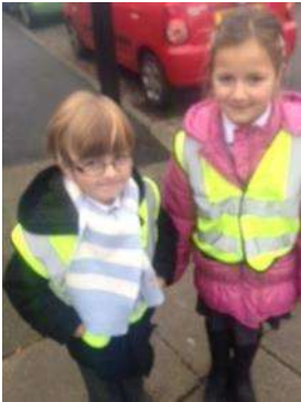
Year 1 pupils carrying out their traffic observing.

Pictured here are just some of the pupils and staff member who carried out the surveys and observations.