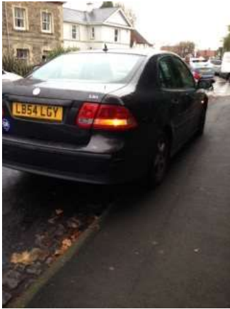
Cars parked on pavement