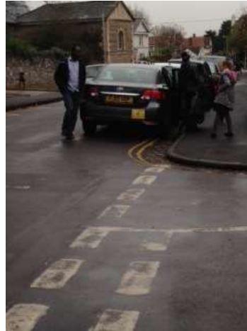
Cars/taxi dropping off on double yellow lines